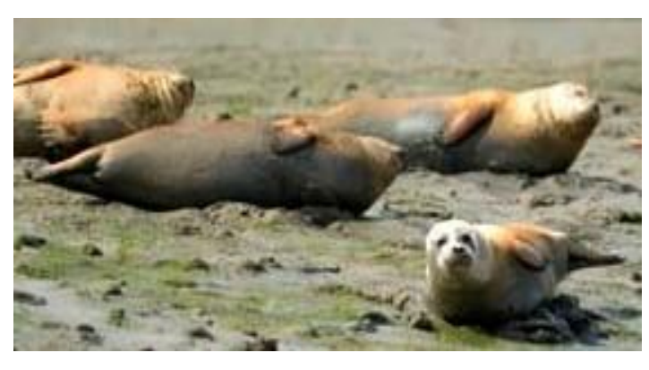
More information can be found here.

We are lucky to have an established a seal colony at Langstone. The Harbour Seal